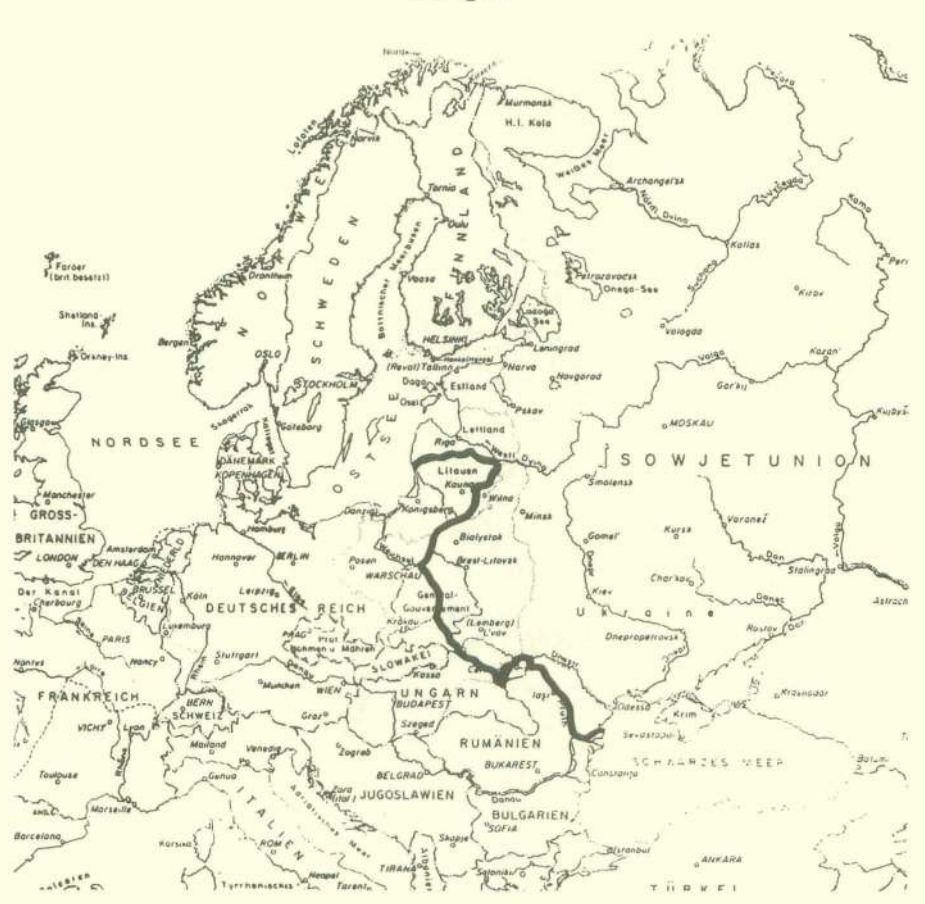
German-Soviet demarcation, as set by the Hitler-Stalin Pact of 23 August 1939.